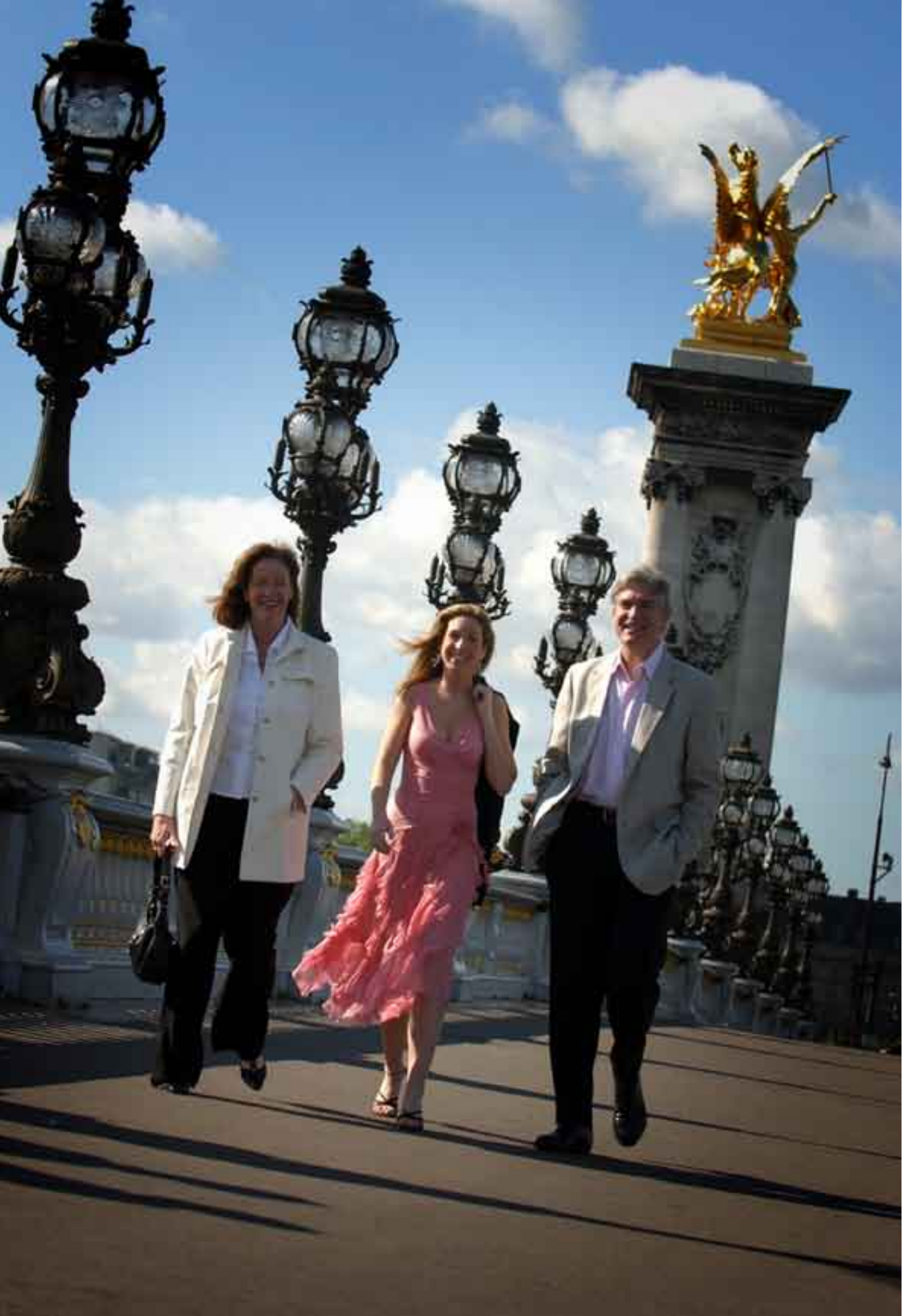
Pont Alexandre 111